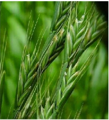
TARES: Lolium Temulentum