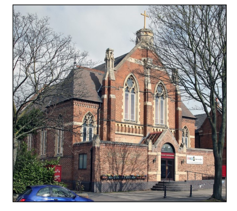
Radford Road LEP Radford Road Leamington Spa CV31 1NF

God of reconciling love, we give you thanks for our partnership in the Gospel with sisters and brothers of other traditions. We pray for the united witness of Radford Road Church as we serve our neighbours of all faiths and none. May our work, our welcome and our worship be signs of your love and light; may those we encounter each day reveal to us your truth and presence; and may all who are part of this community know your justice and peace; we ask in the name of Jesus, our brother, Amen .