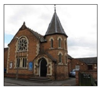
Cubbington Methodist Church Queen Street Cubbington Leamington Spa CV32 7NA