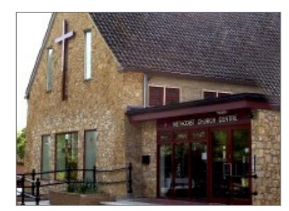
Stratford Upon Avon Methodist Church Old Town, Stratford-upon-Avon, CV37 6BG

Gracious God as we build a new circuit we know that 'you go before us and we have the joy of following in your footsteps. Shine a light when the road is dark and we are afraid; clear the way when the path is overgrown; lift us up when we stumble or fall. Forgive us if we miss the path because we have not been paying attention, or have been listening to other voices, or we have fallen behind and can only distantly hear your call. Help us, Holy Spirit when we hear your voice calling us on, to quicken our step and keep in step with you and with one another'. Amen