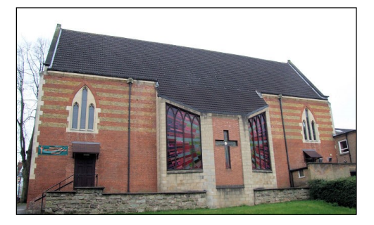
Warwick Methodist Church Barrack Street Warwick CV34 4TH